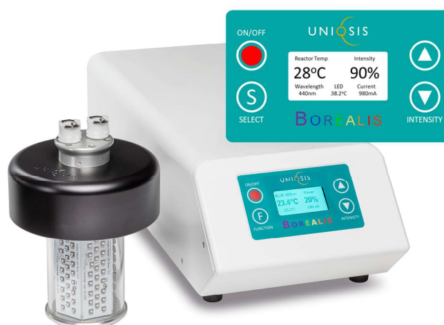
Borealis 180W LED lamp and Borealis Digital PSU

Although Borealis Flow coil reactors can be wound with other materials and volumes, the standard coil reactor offered uses FEP tubing and has an internal volume of 15ml.