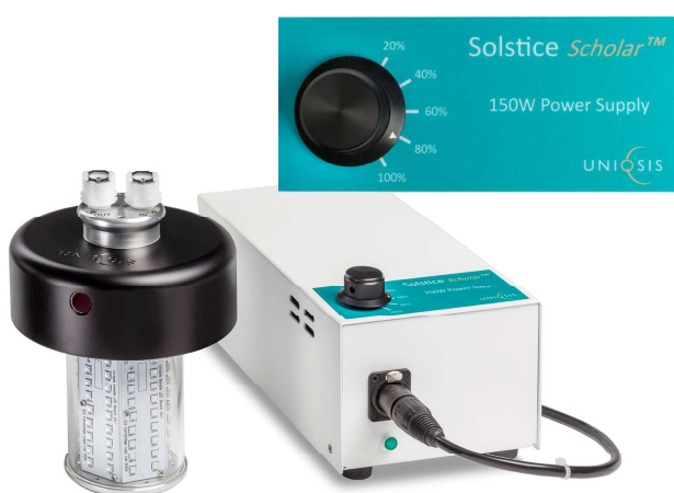
Borealis 120W LED lamp and Borealis Scholar PSU

The 180W LED lamps are fitted with 180x high power LEDs and are powered by a larger PSU with digital current control that enables the lamp intensity to be varied in 5% increments. In addition to showing lamp intensity, the digital PSU also displays lamp current and wavelength, and both the internal reactor and LED backplate temperatures. External serial and ethernet comms ports are fitted to facilitate system integration and remote control.