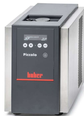
Huber Piccolo recirculator

Alternatively, where the lamp and reactor temperatures are significantly different, it is recommended that the reactor temperature is controlled using the recirculator, and a separate cooling water supply is used to cool the Borealis LED lamp module.