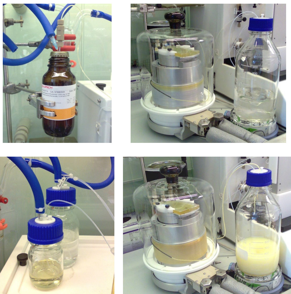
Figure. Preparation of intermediate 3 using FlowSyn fitted with a 'Cold Coil' and Static Mixer Chip.

^1\text{H-NMR} ( \text{CDCl}_3 ; 400Hz): 4.30 (2H, s), 7.1-7.2 (4H, m), 8.0-8.1 (2H, m), 8.58 (2H, dd, J = 4.8).