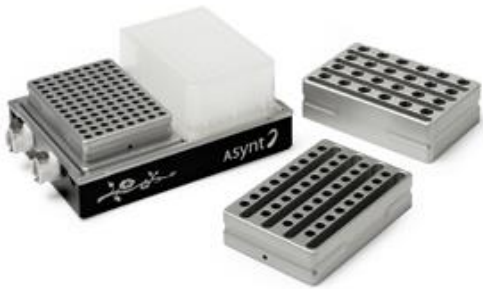
Caption: Asynt Chilliblock