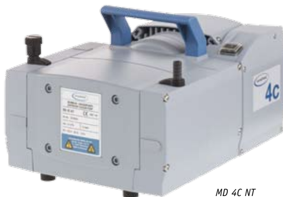
MD 4C NT down to 1.5 mbar

due to PTFE sandwich design and stress free fixing of the diaphragms